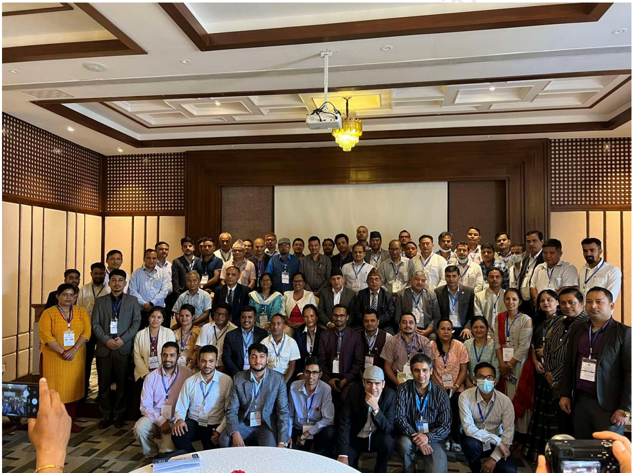
Figure 4: Workshop on “Streamlining Academic Research and Innovation in Pokhara University (SARIPU) (5-7 September 2022)