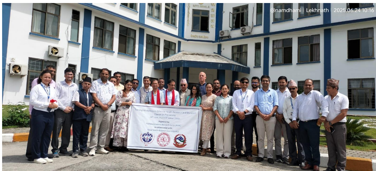
Figure 7: Training Workshop on Ethics in Health Research and Standard Operating Procedures (24 June 2025)