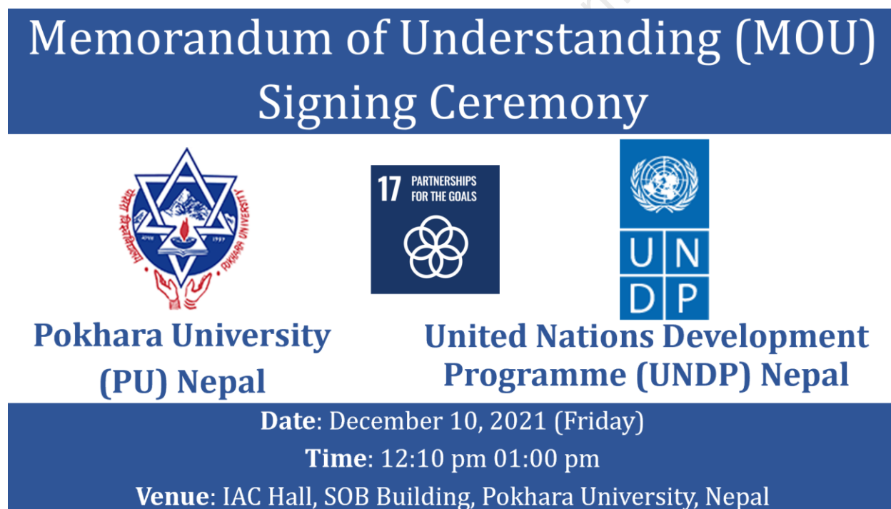
Figure 9: Banner of MOU signing ceremony between PU and UNDP Nepal