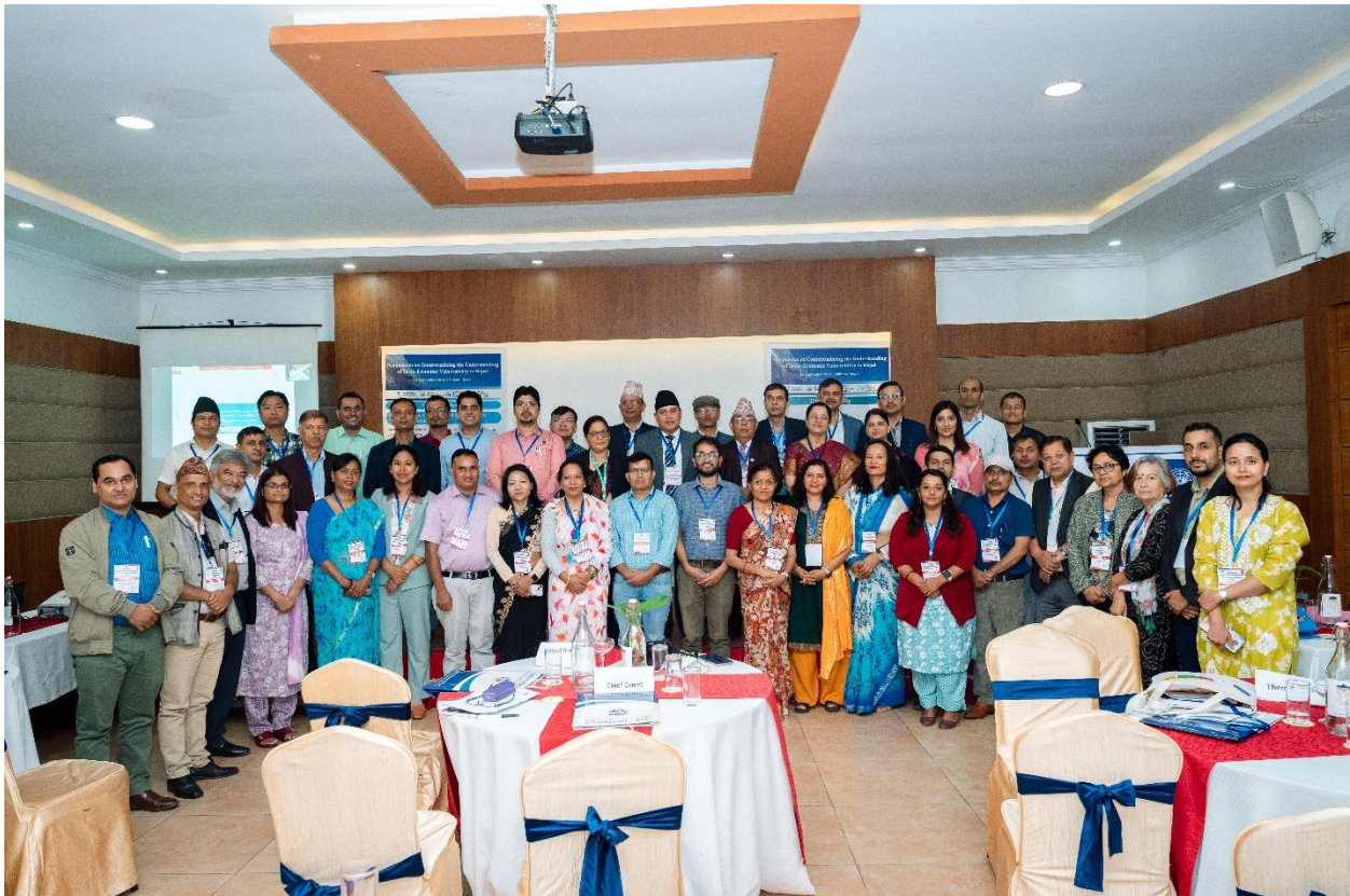
Figure 5: Symposium on “Contextualizing the Understanding of Socio-Economic Vulnerability” (13 September 2024)