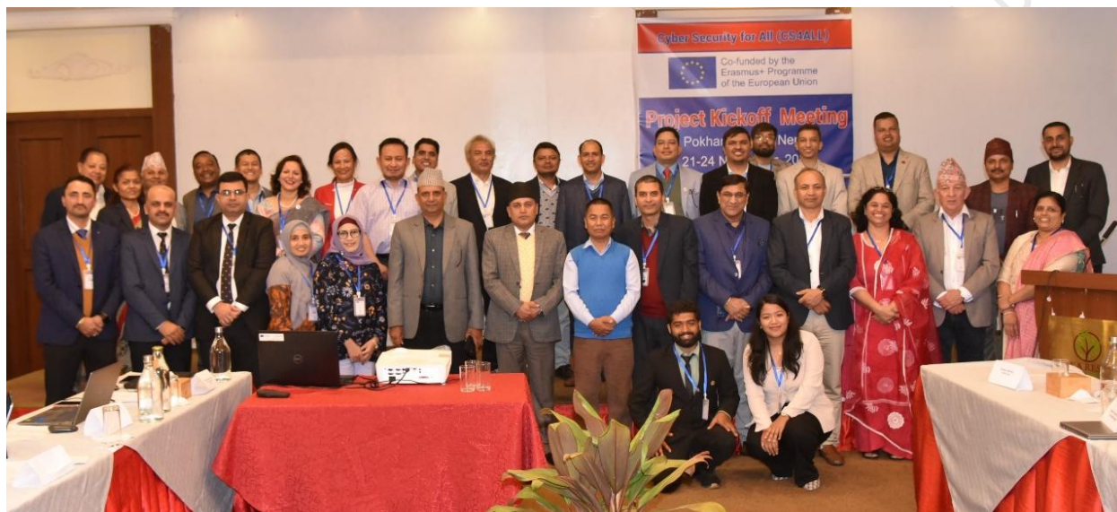
Figure 10: A picture taken at the Kickoff meeting of CS4ALL (21-24 November 2023)

facilitated international staff mobilities, in collaboration with International Relation Center, under ERASMUS+ program of European Commission. As a part of project activities, PURC hosted international consortium meeting of CS4ALL (Figure 10) and MAGENDA (Figure 11) projects bringing international participants to Pokhara University for knowledge and cultural exchange among the participants from the consortium partners. Besides, PURC and CS4ALL student club of Pokhara University organized several awareness seminars on digital literacy and cybersecurity for students, teachers, staff, and general public (Figure 12 and 13)