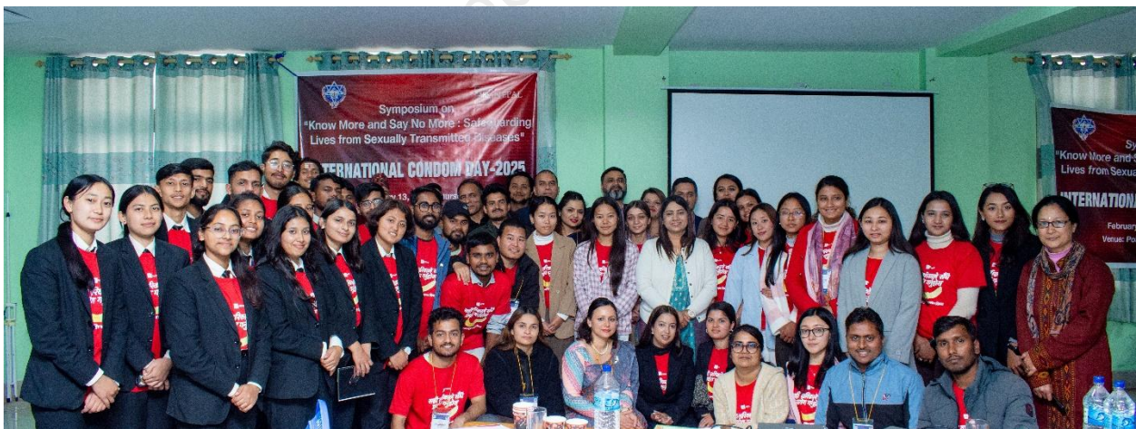
Figure 6: Symposium on Know More and Say No More: Safeguarding Lives from Sexually Transmitted Diseases (February 13, 2025)