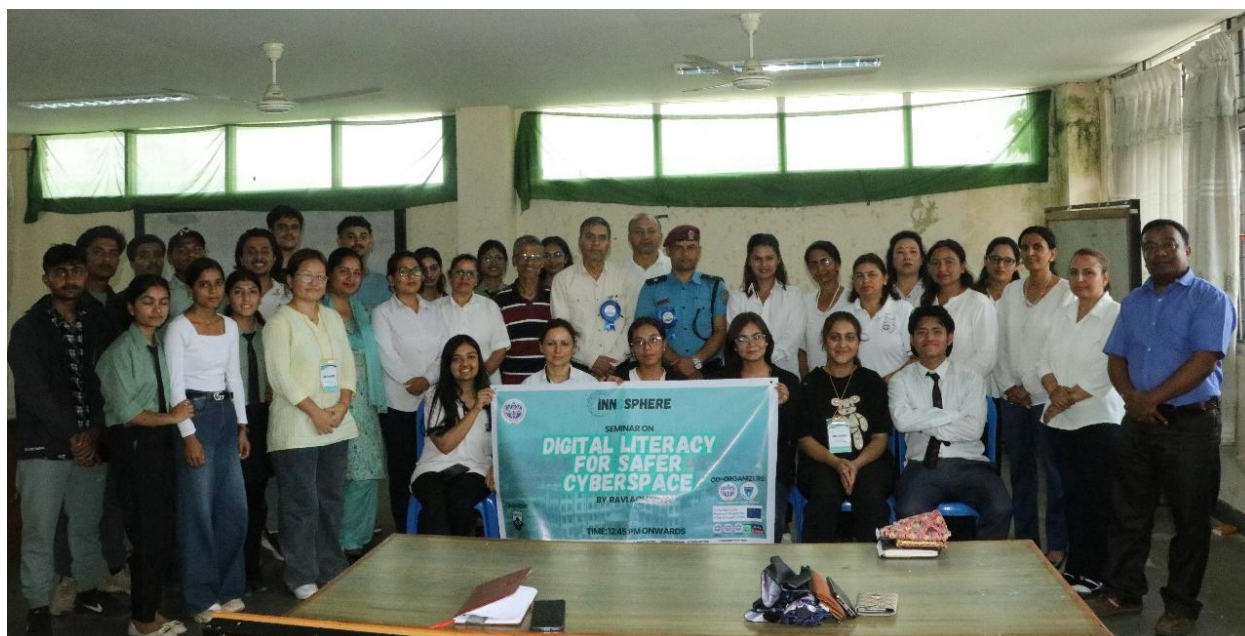
Figure 12: Cybersecurity Awareness Seminar (8 June 2025)