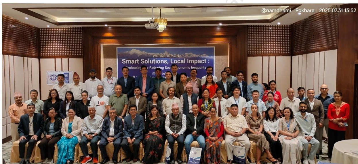
Figure 8: Workshop on “Smart Solutions, Local Impact: Technology for Reducing Socio-Economic Inequality” (31 July 2025)