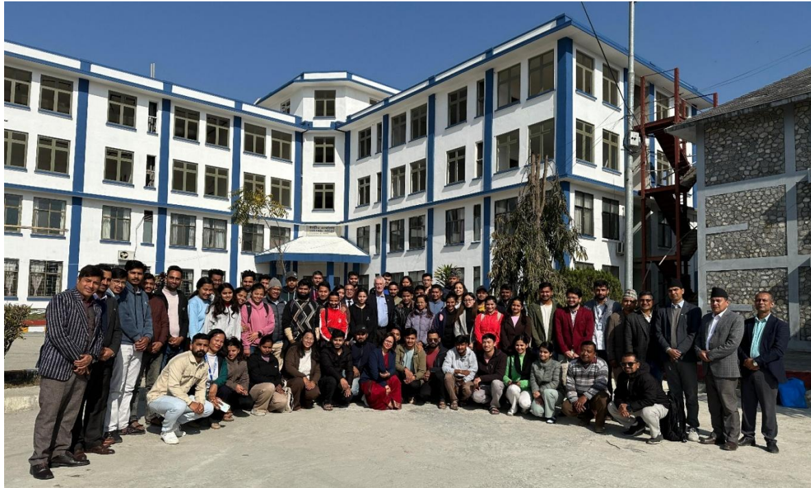
Figure 1: A picture taken after an interaction seminar with the Nobel Laureate Sir Richard J Roberts (23 February 2024)

on the visitor note, Sir Richard emphasized adopting policies to enable students to learn and come back to improve Nepal (Figure 2).