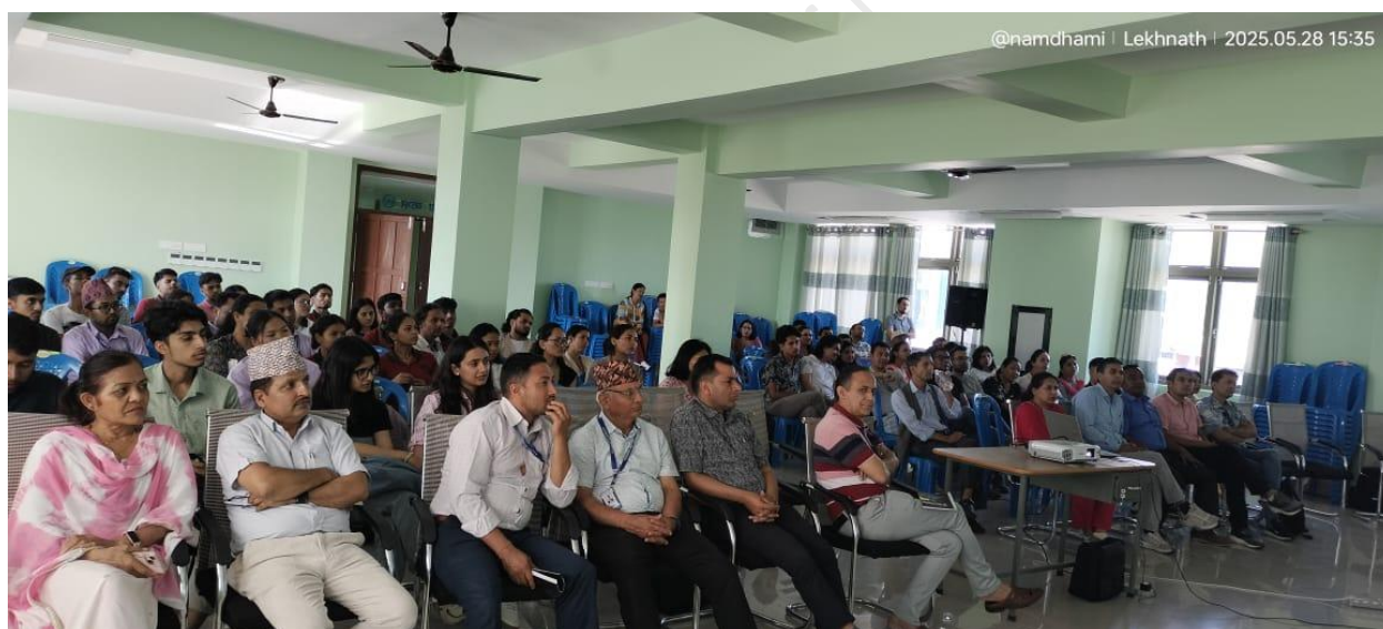
Figure 13: Cybersecurity Awareness Seminar (28 May 2025)