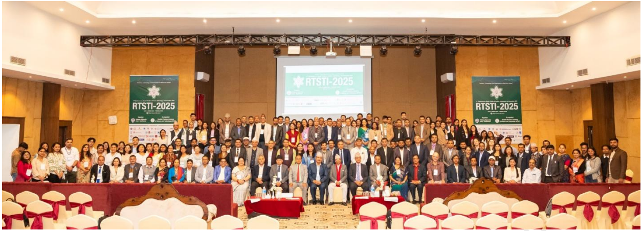
Figure 3: Poster (above) and group (below) photograph of RTSTI-2025 (19-21 March 2025)