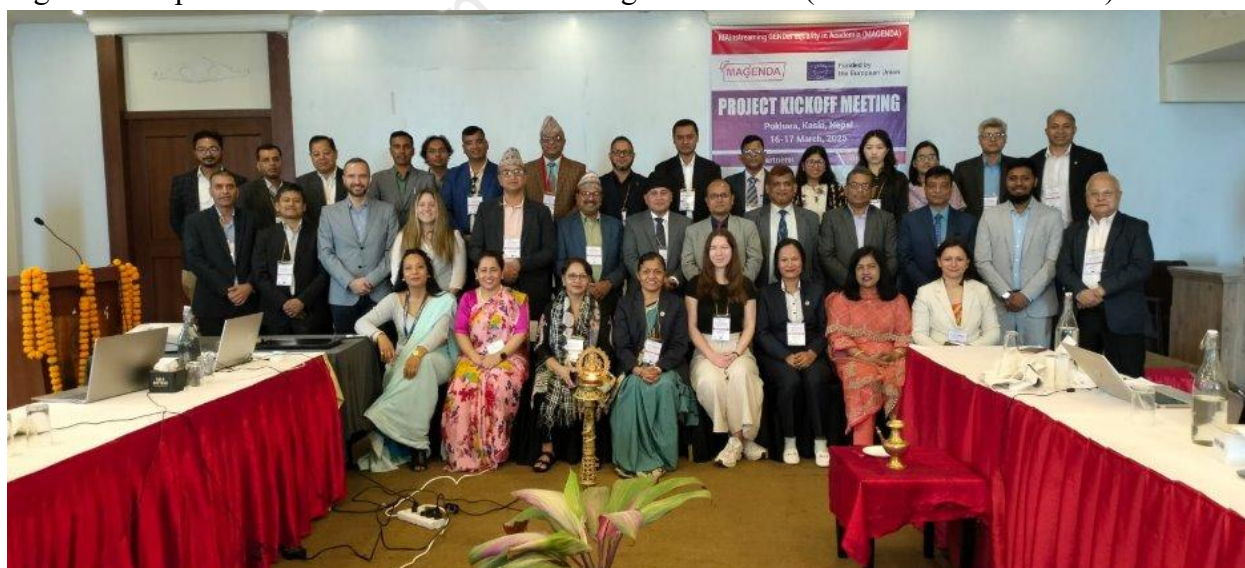
Figure 11: A picture taken at the Kickoff meeting of MAGENDA (16-17 March 2025)